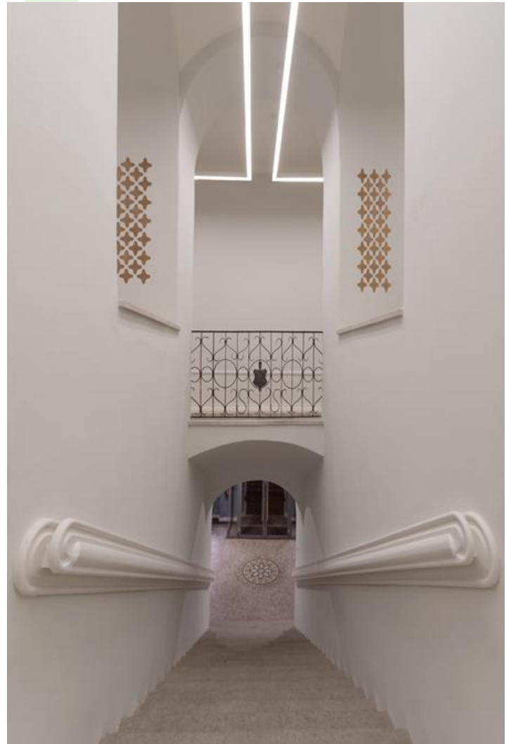
Manor house from the 17th century, Łodygowice

Light fitting made out of aluminium profile equipped with opal diffuser or MPRM and driver. X-LINE fittings are intended to be mounted on ceiling or pendants. The luminaires are adjusted to be linked together with specially designed links, which provide great freedom in arranging elements of the system as well as great functionality. In the family of X-LINE LED fittings modules of renowned brands are applied.