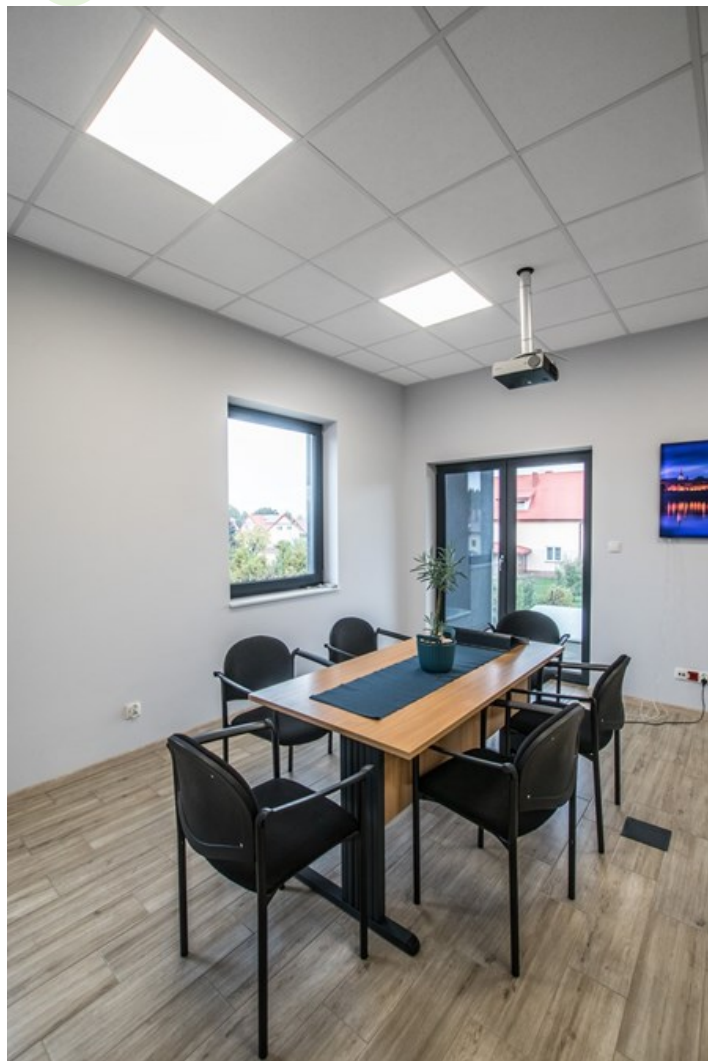
"Elclim" office, Toruń

Modern LED panel dedicated to be mounted on suspended modular ceilings, cardboard suspended ceilings (using adaptive frame), directly on the ceiling (using adaptive frame) or using adaptive frame and suspensions. Equipped with the highly efficient LED sources. Direct light distribution. Luminary body made from steel sheet. PMMA opal diffuser. Colour of luminary - white. CRI>80. Luminary dedicated for the public use structure like offices, conference rooms, classrooms, lecture halls etc.